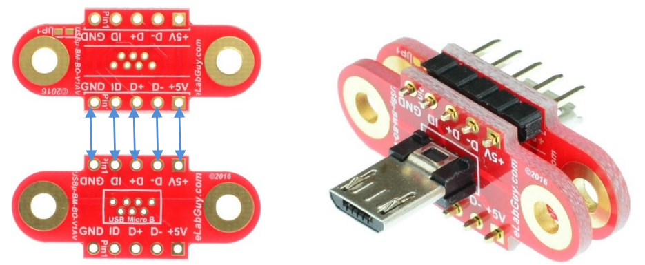
Figure 5: Combine a normal USBu-BM-BO-V1AV and another USBu-BM-BO-V1AV with the USB connector soldered on the back of the PCB to form a micro USB Male to Male adapter.